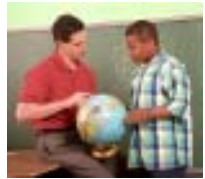
Planning for Transition Services begins at age 14 and is based on students' interests, preferences, and needs.