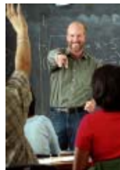
Student preparation for life after high school may include classroom lessons and connections to outside agencies.

We collaborate with families, school personnel, employers, and outside agencies, empowering students to make decisions, set goals, and carry out their transition plans from school to post-school opportunities.