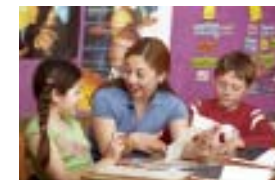
DOTS provides students with work experiences necessary to make more informed decisions for their future.