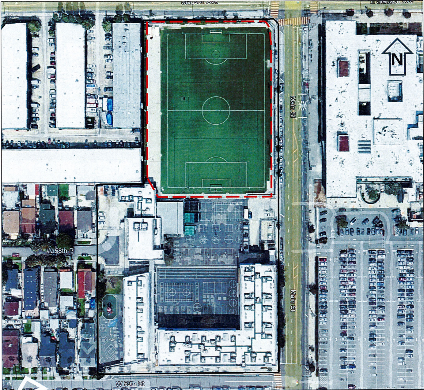
EXHIBIT A – CAMPUS SITE PLAN (not to scale)