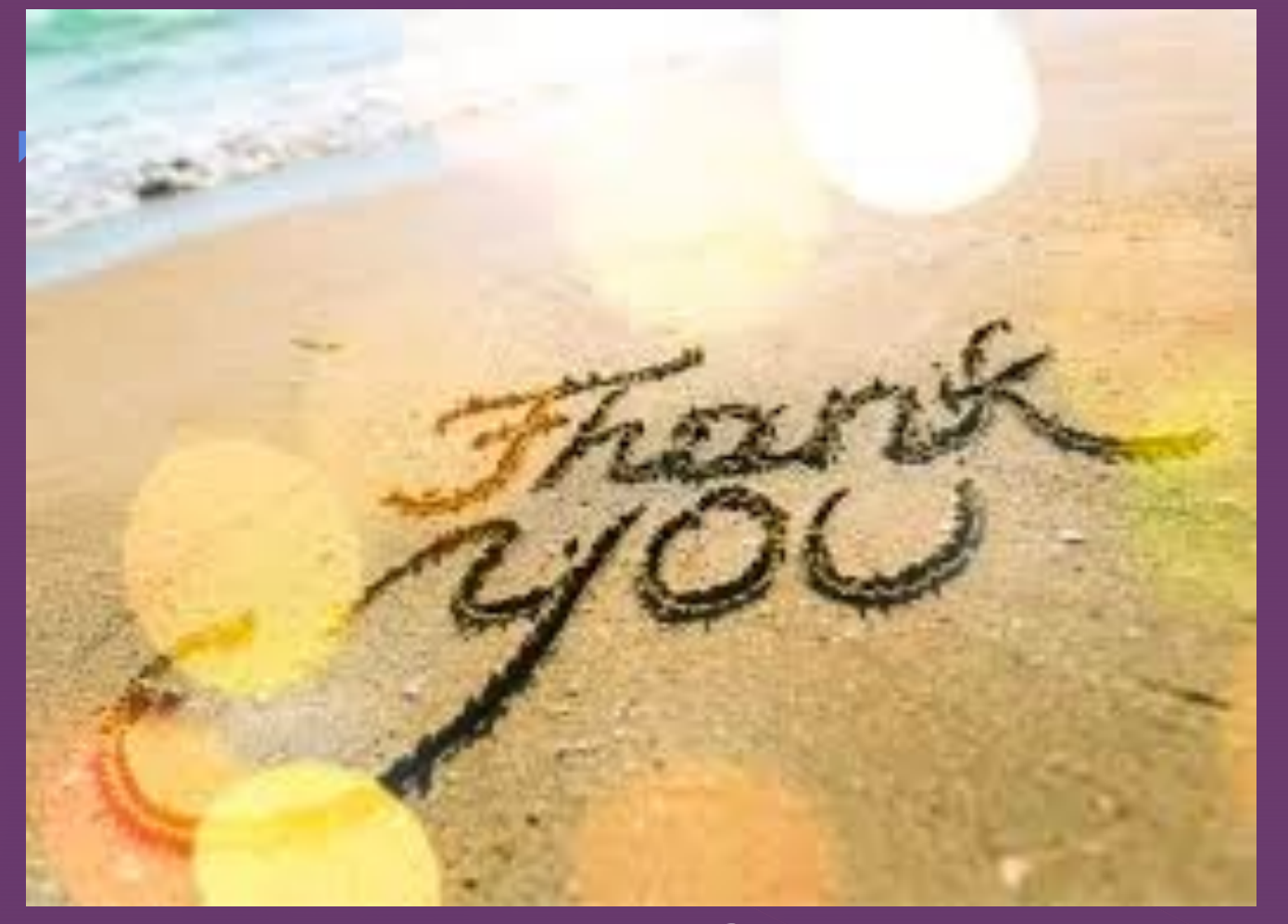
With Gratitude, Thank you! LDNW Parent & Community Engagement